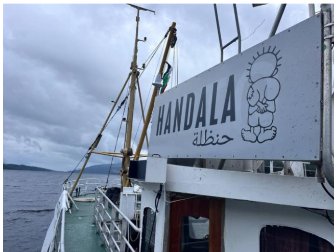
The Handala prepares to head to GAZA later this year.

Note: The Freedom flotilla boat to Gaza this year is called Handala. The latest update on the flotilla and its visit to Cardiff in Wales is here .