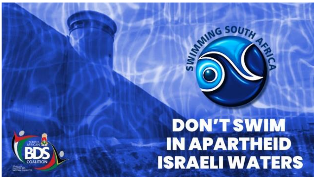
Graphic from South African activists opposing their team going to Israel