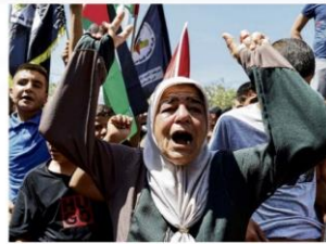
Ongoing tension . . . A mourner reacts during a funeral following an Israeli raid near Jenin, in the Israeli-occupied West Bank.

It has a prime minister, Netanyahu, who just two months ago said Israel "needs to crush the Palestinian ambition for an independent state". This new regime has stepped up the destruction of Palestinian communities, often with the support of lawless Israeli settlers, and has declared its "top priority" is to push ahead with more illegal Jewish-only