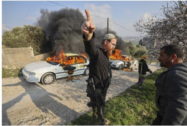
An armed settler orders a Palestinian to leave the country after settlers attacked the Palestinian village of Burin in the occupied West Bank and burned dozens of homes, shops, and cars on 25 February, 2023