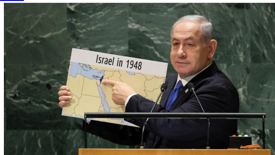
Israeli Prime Minister Benjamin Netanyahu holds up a map showing the occupied West Bank and Gaza as part of Israel during his speech at the UN General Assembly, 22 September 2023