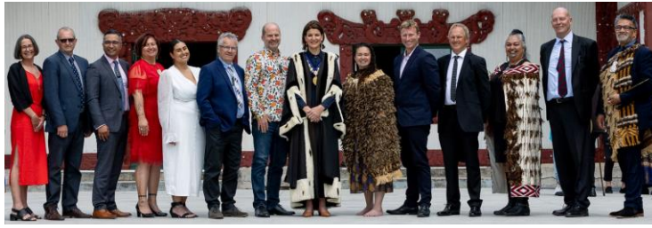
Gisborne District Council

Find your local body Mayor, Chair and Councillor email details here and copy and paste this message to them in an email.