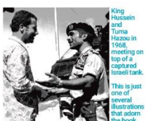
King Hussein and Tuma Hazou in 1968, meeting on top of a captured Israeli tank. This is just one of several illustrations that adorn the book.

—Janfríe Wakim, NZ Human Rights Activist