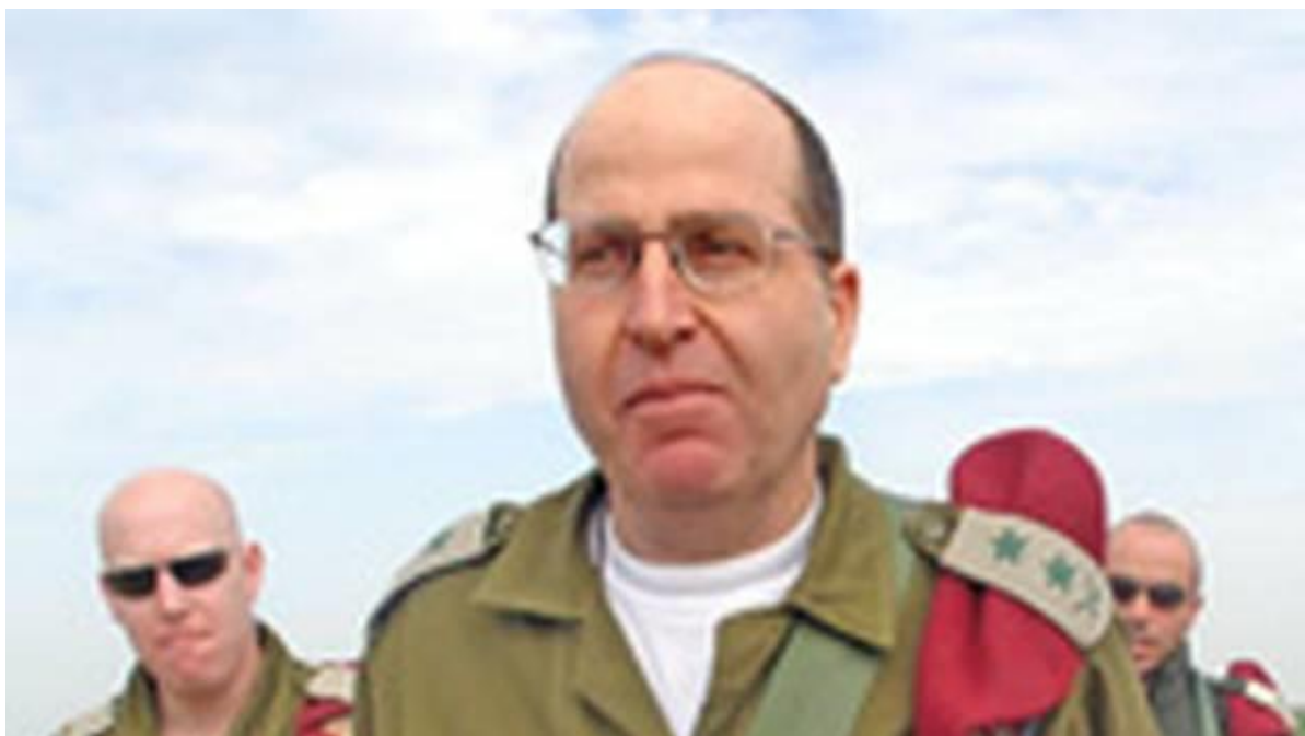
Former Israeli Defence Force Chief Moshe Ya'alon – the butcher of Qana

It was only the intervention of Deputy Prime Minister Michael Cullen at the time which saved Ya'alon from arrest.