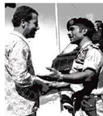
King Hussein and Tuma Hazou in 1968, meeting on top of a captured Israeli tank.

—Janfrie Wakim, NZ Human Rights Activist