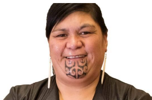
New Minister of Foreign Affairs Nanaia Mahuta

We don't have an answer yet as to how the new Minister of Foreign Affairs Nanaia Mahuta will approach Palestine.