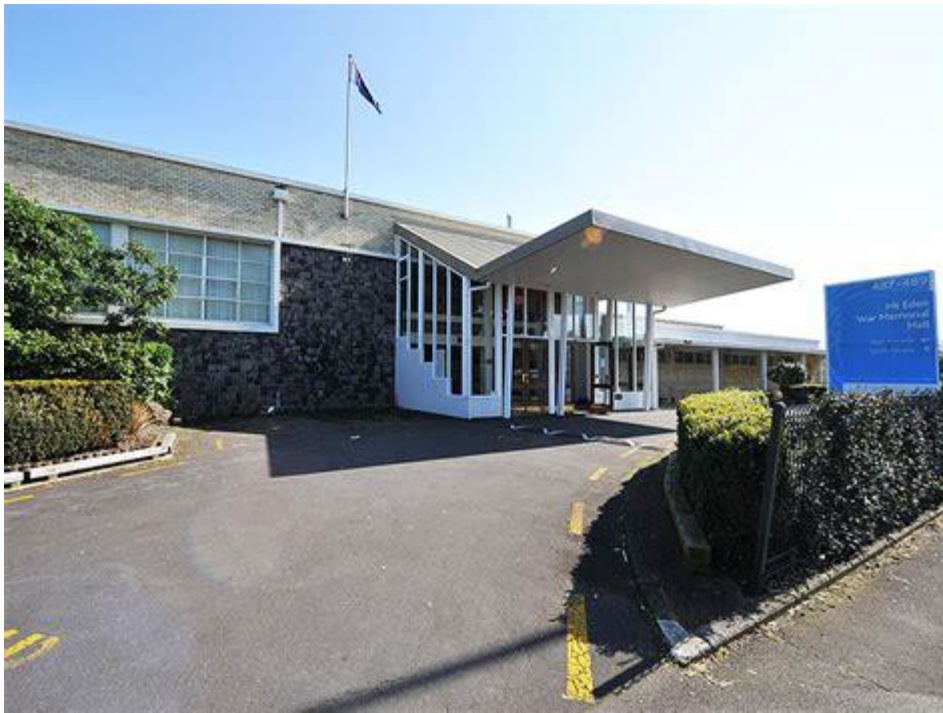
Mt Eden War Memorial Hall

Planning is well underway for our first post-Covid face-to-face national meeting in Auckland on the weekend of 27/28 March. It will be held at the Mt Eden War Memorial Hall in Dominion Road.