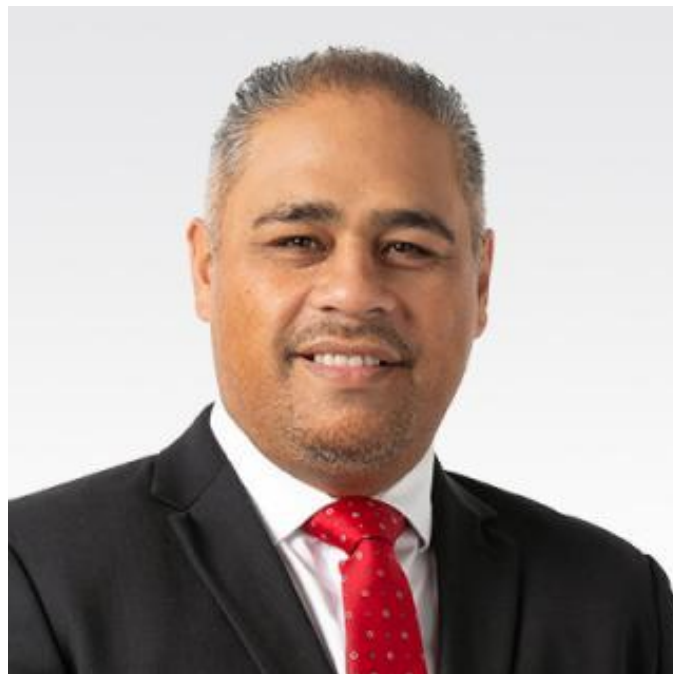
Minister of Defence Peeni Henare