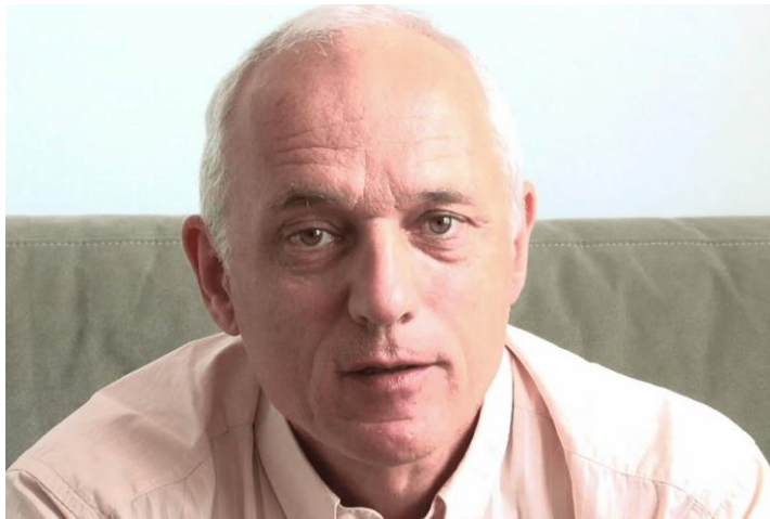
French Surgeon Christophe Oberlin

French surgeon Christophe Oberlin has written a book on the difficult path to get Israeli war crimes investigated by the ICC (International Criminal Court).