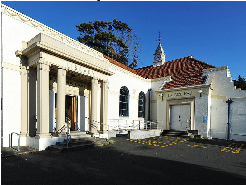
Grey Lynn Library Hall – 474 Great North Road, Grey Lynn, Auckland

Our first post-Covid face-to-face national meeting in Auckland on the weekend of 27/28 March. It will be held at the Grey Lynn Library Hall on Great North Road – adjacent to St Joseph's Catholic Church. It's a lovely venue and larger than the previous one which will enable us to arrange lunch and dinner on site without shifting to another venue.