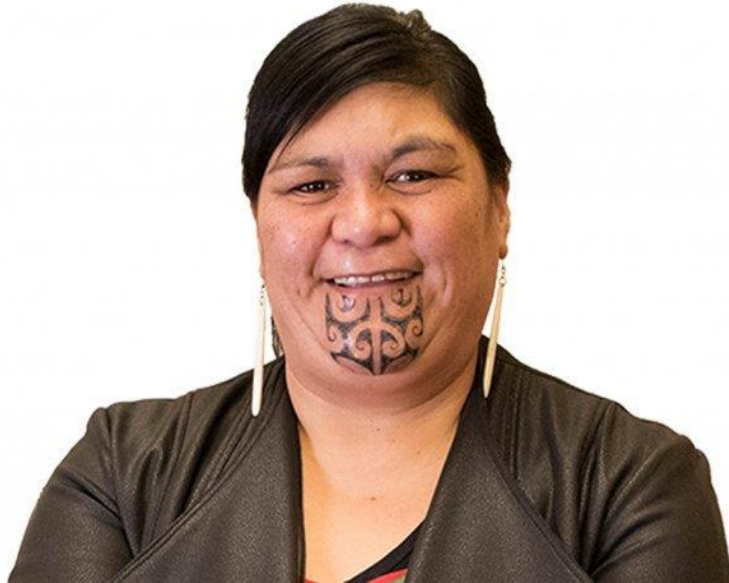
Minister of Foreign Affairs and Trade Nanaia Mahuta

We have sent several letters to the Minister of Foreign Affairs recently. Here is one of them – no response at yet. We will keep you posted.