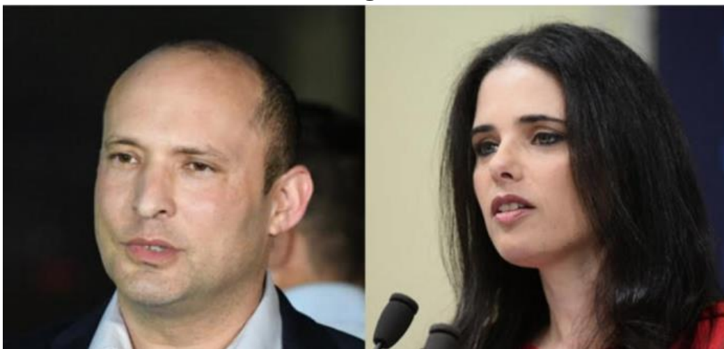
Israeli Prime Minister-in-Waiting Naftali Bennett and his Yamina Party partner-in-racism Ayelet Shaked