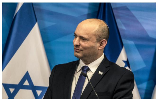
A new coalition government is being led by Yamina Party leader Naftali Bennett in Israel.

Comment - It's tempting to think Israel's new government might be a sign that change is in the air after 12 years of hard-right rule by Benjamin Netanyahu.