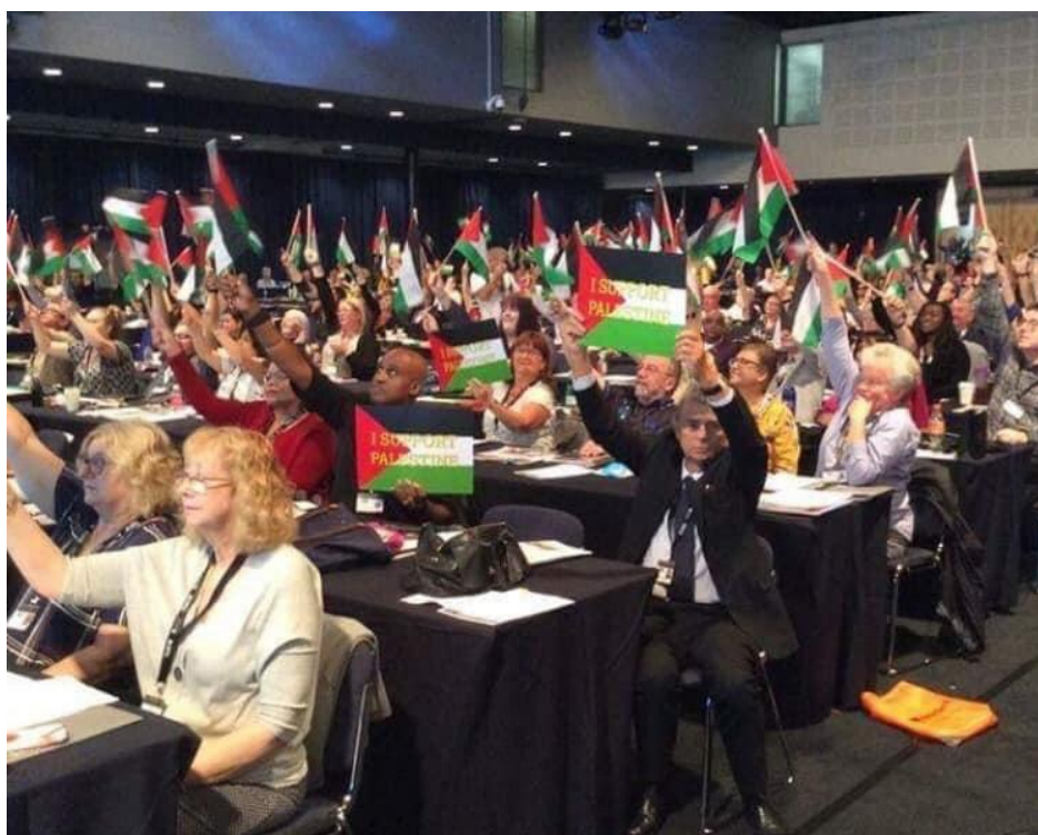
Delegates vote on Palestine resolution