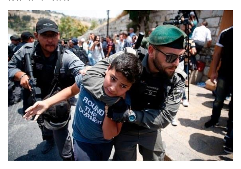
Here is the joint statement from Amnesty International and Human Rights Watch:

This criminal designation of legitimate human rights groups is the mark of a racist, totalitarian state.