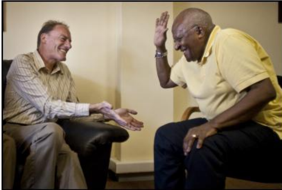
PSNA National Chair meeting Tutu in South Africa in 2009

In this case all the activists on trial were acquitted after the jury deliberated.