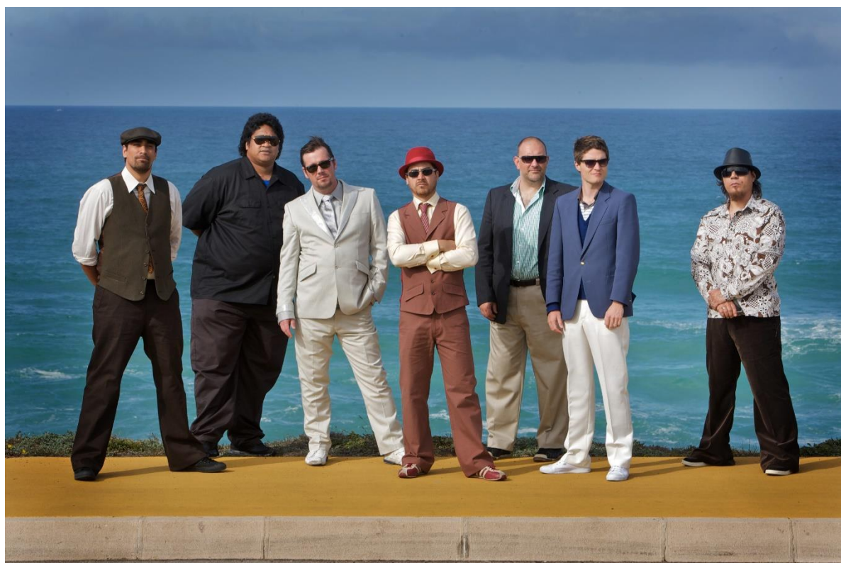
Fat Freddy's Drop

The boycott of the festival is growing with stories here , here , here , here and here . Aotearoa New Zealand must join the boycott and last week PSNA wrote to Fat Freddy's Drop asking them to boycott the Festival.