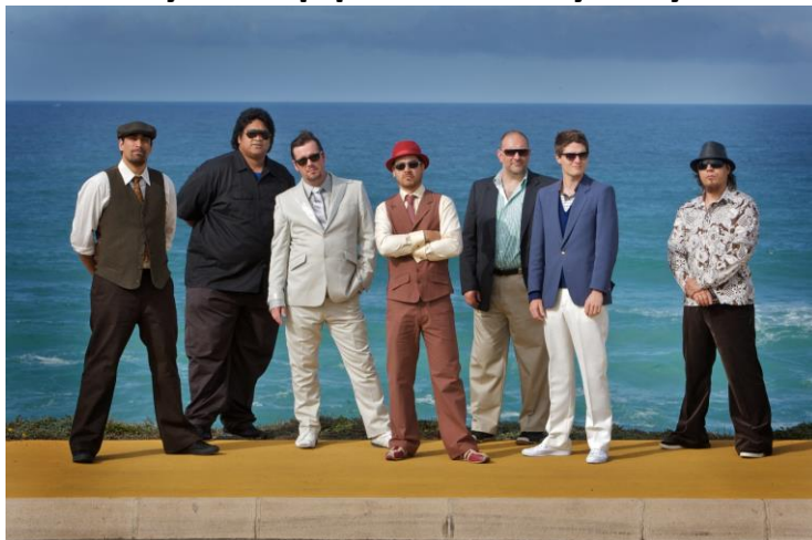
Fat Freddy's Drop