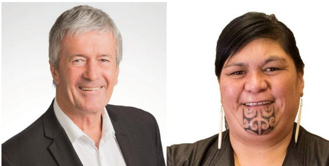
Minister of Primary Industries Damien O'Connor and Minister of Foreign Affairs Nanaia Mahuta

“Our government and farming groups should be demanding Palestinian refugees be allowed to return to their land instead of helping Israel profit from this stolen land”.