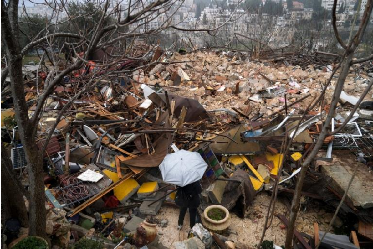
The demolished Salhiyeh family home in East Jerusalem

Israel is continuing its policies of ethnic cleansing of Palestinians from East Jerusalem with the demolition of the Salhiyeh family home in Sheikh Jarrah .