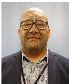
Te Pāti Māori co-leader Rawiri Waititi

Speaking in parliament last week on sanctions against Russia Te Pāti Māori co-leader Rawiri Waititi gave the best speech by a long way.