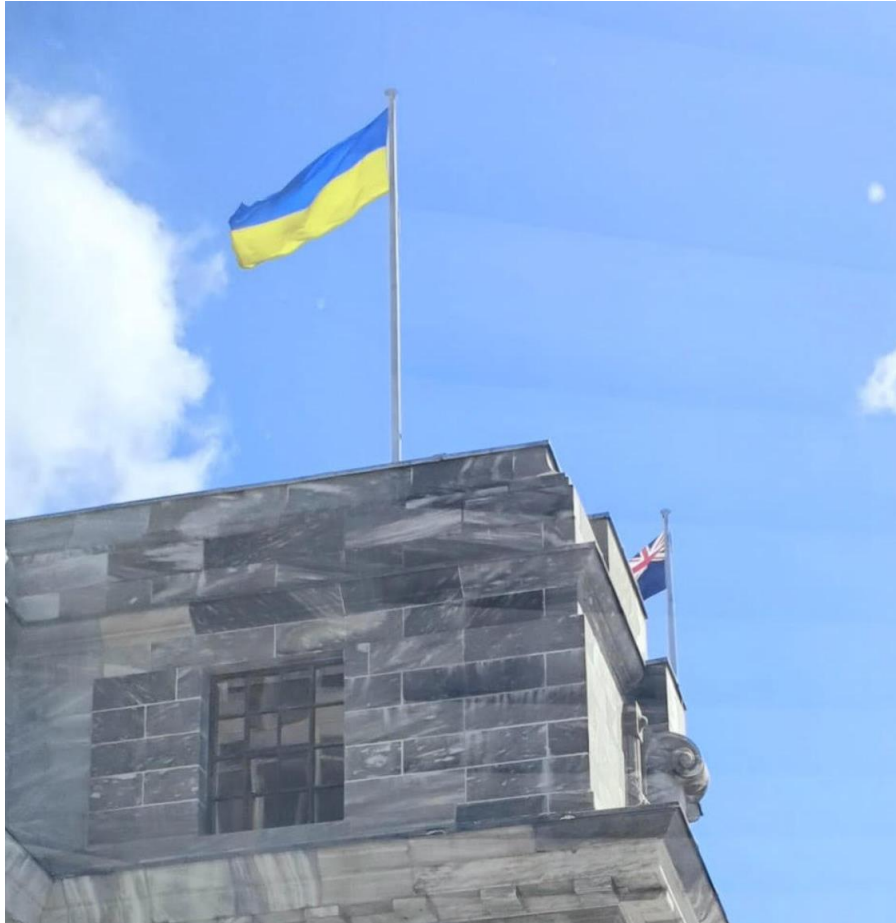
The Ukrainian flag flying over the Aotearoa New Zealand parliament this week

PSNA National Chair asked the question “When will the Palestinian and West Papuan flags fly over parliament?” in a blogpost last week here