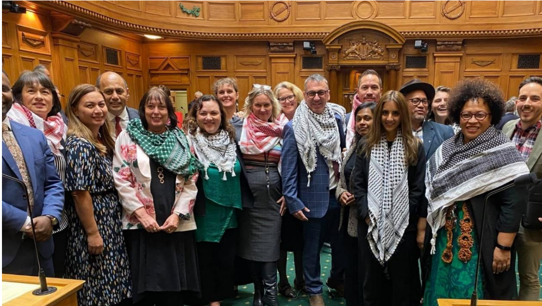
This photo from World Kufiya Day last year with New Zealand parliamentarians showing solidarity with Palestine by wearing a kufiya

Don't miss out this year – get your Kufiya from Preserved Identity at this link – run by Palestinian New Zealanders based in Auckland – and be ready for World Kufiya Day on Wednesday 11 May.