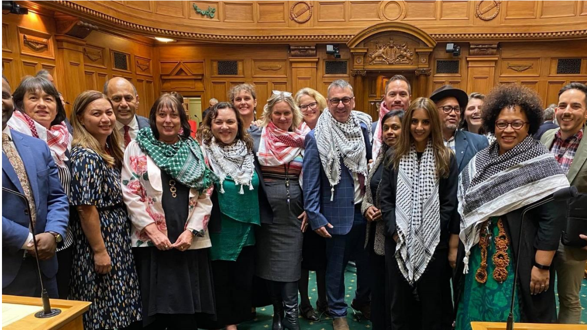
This photo from World Kufiya Day in 2021 with New Zealand parliamentarians showing solidarity with Palestine by wearing a kufiya

Here is the photo again from Kufiya Day last year in parliament's debating chamber.