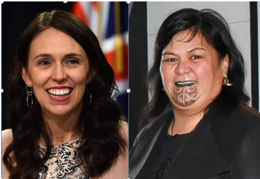
Ms Ardern and Ms Mahuta