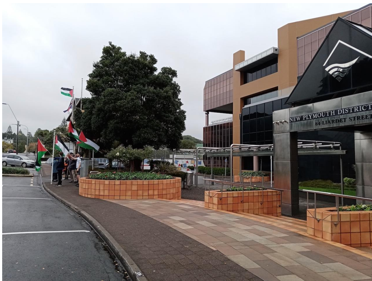
Palestinian flag flies high at the New Plymouth District Council

* Nakba Day remembers the campaign of ethnic cleansing of over 700,000 Palestinians from their homes and villages by Israeli militias in 1948. Dozens of massacres took place as more than 500 villages were emptied in an Israeli military offensive titled Plan Dalet.