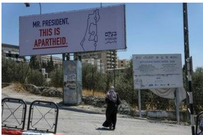
Israeli human rights group B'Tselem put up billboards to give Biden a clear message...

There were low expectations for US President Biden's visit to Israel and the occupied West Bank. Biden did nothing to change that expectation. Here are a few articles which discuss his visit: