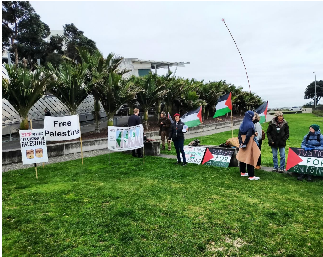
New Plymouth activists rally for Masafer Yatta

If you haven't already done so - send a brief message of support to the people of Masafer Yatta. These messages will be translated into Arabic and forwarded to the people under threat of ethnic cleansing. Email your message of support to manal@stopthewall.org