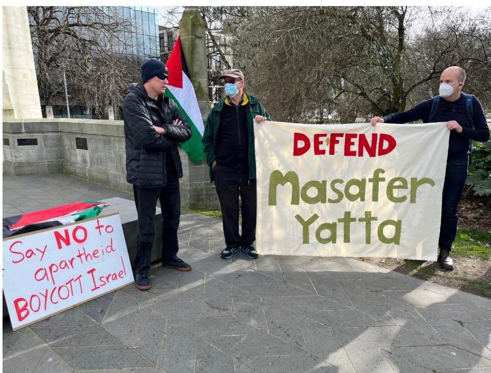
The Christchurch rally featured a new banner we will almost certainly need to use again...