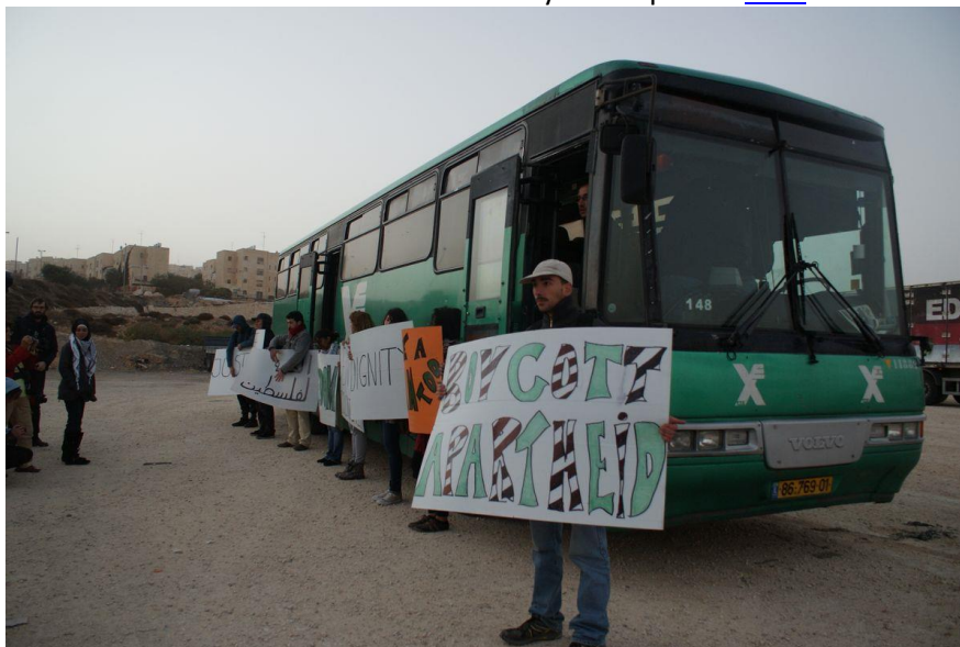
At a 2021 protest against Israel's segregated transport. Story here

Three weeks ago 50 Palestinians were thrown out of an Israeli bus after three Jewish settlers refused to travel with non-Jews. The story was reported here .