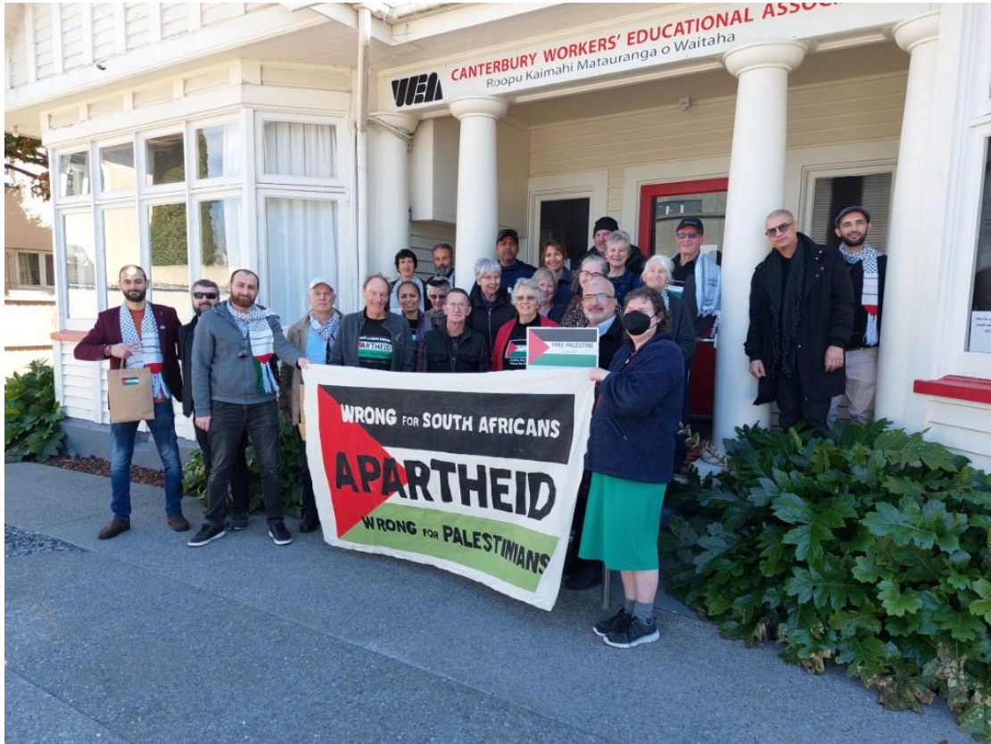
Some of the delegates at the PSNA National meeting in Christchurch last weekend

The meeting was a great success. Through workshops and plenary discussions we have developed several new initiatives and strengthened our approach in existing campaigns. We had delegates from Gore to Auckland, New Plymouth to Napier!