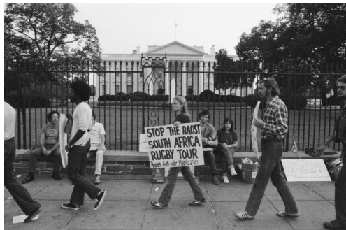
Outside the White House in 1981 opposing the Springbok visit to the US after mass protests hounded the Springbok tour of New Zealand

In the last newsletter we reported on the invitation to an Israeli rugby team to play in a provincial South African rugby competition. The invitation was withdrawn a few days later under a welter of criticism from BDS South Africa which released an excellent statement and other Palestine solidarity groups.