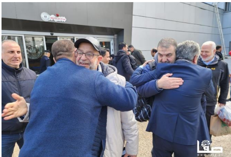
A delegation of the Miles of Smiles 41st solidarity aid convoy enters besieged Gaza.