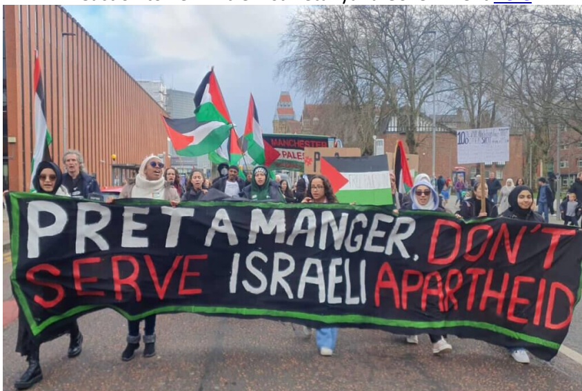
Pret A Manger – don't serve Israeli apartheid here