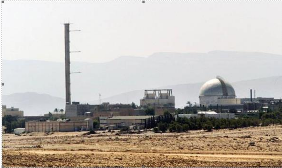
A partial view of the Dimona nuclear power plant in Israel's Negev desert, September 2002.